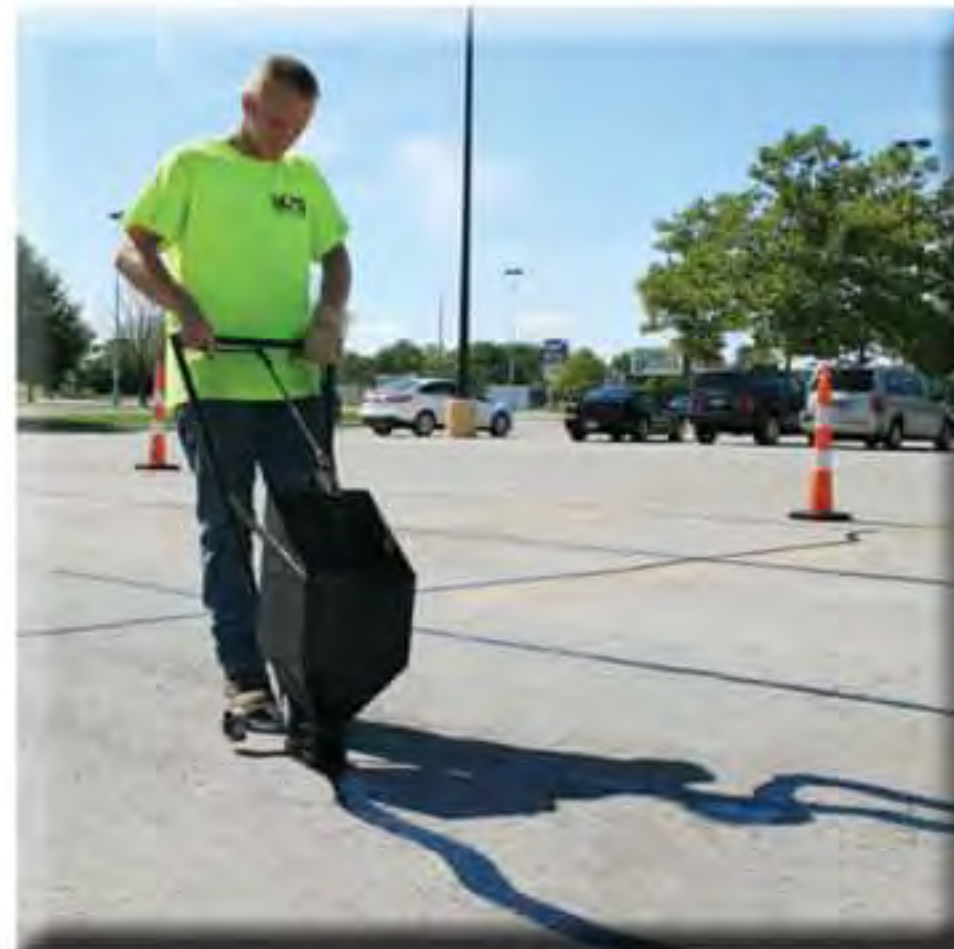
Pour Pots and Crack Banders