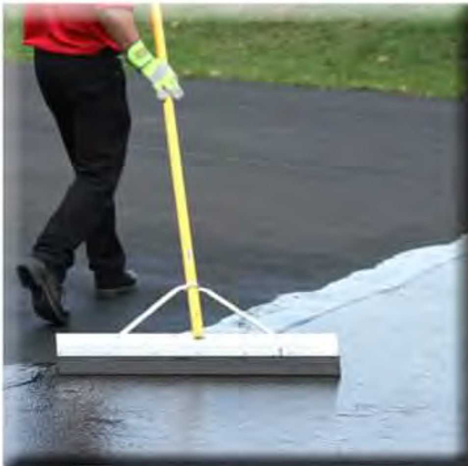
Squeegees and brushes