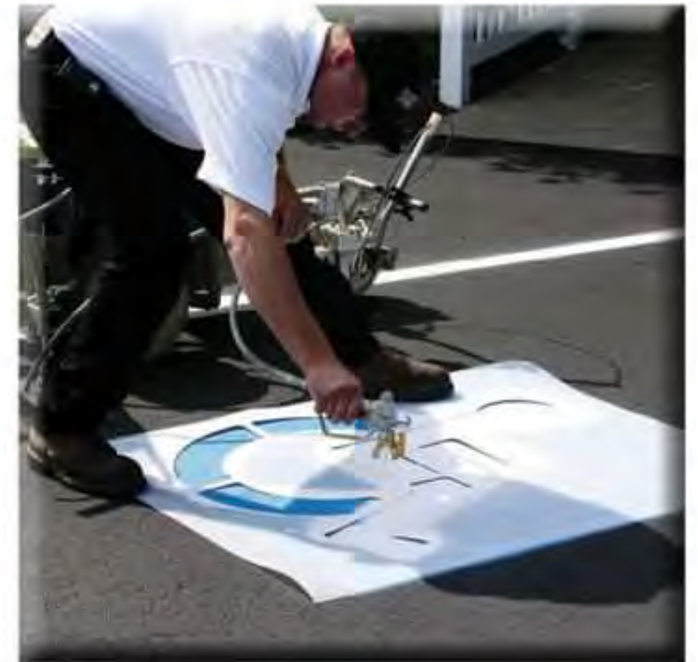
Traffic Marking Stencils