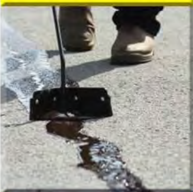
Trowel Grade Crack Filler®