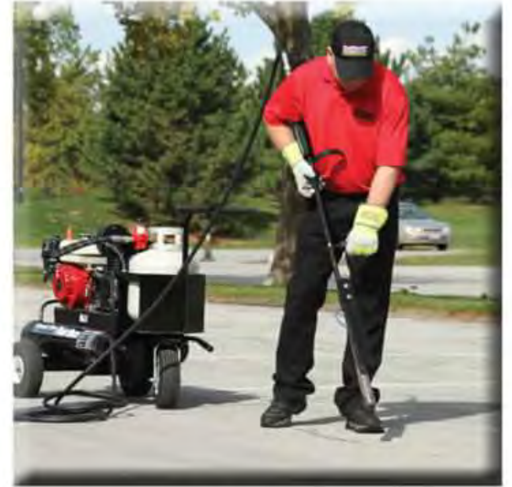
Crack Cleaning Equipment