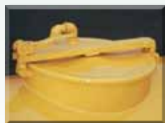
Lock down lid with breather vent