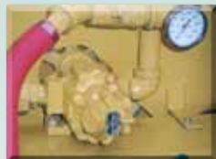
Positive Displacement Material Pump