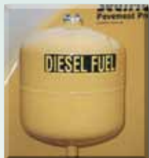
5 Gallon Diesel Wash Down System