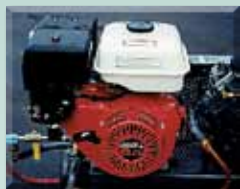
8 H.P. Honda Engine