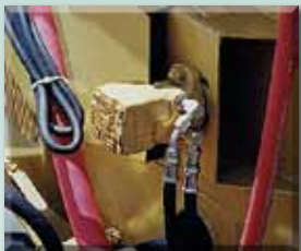
Hydraulically Driven Agitation