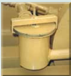
Easy Access Basket Strainer Reduces Tip Clogging