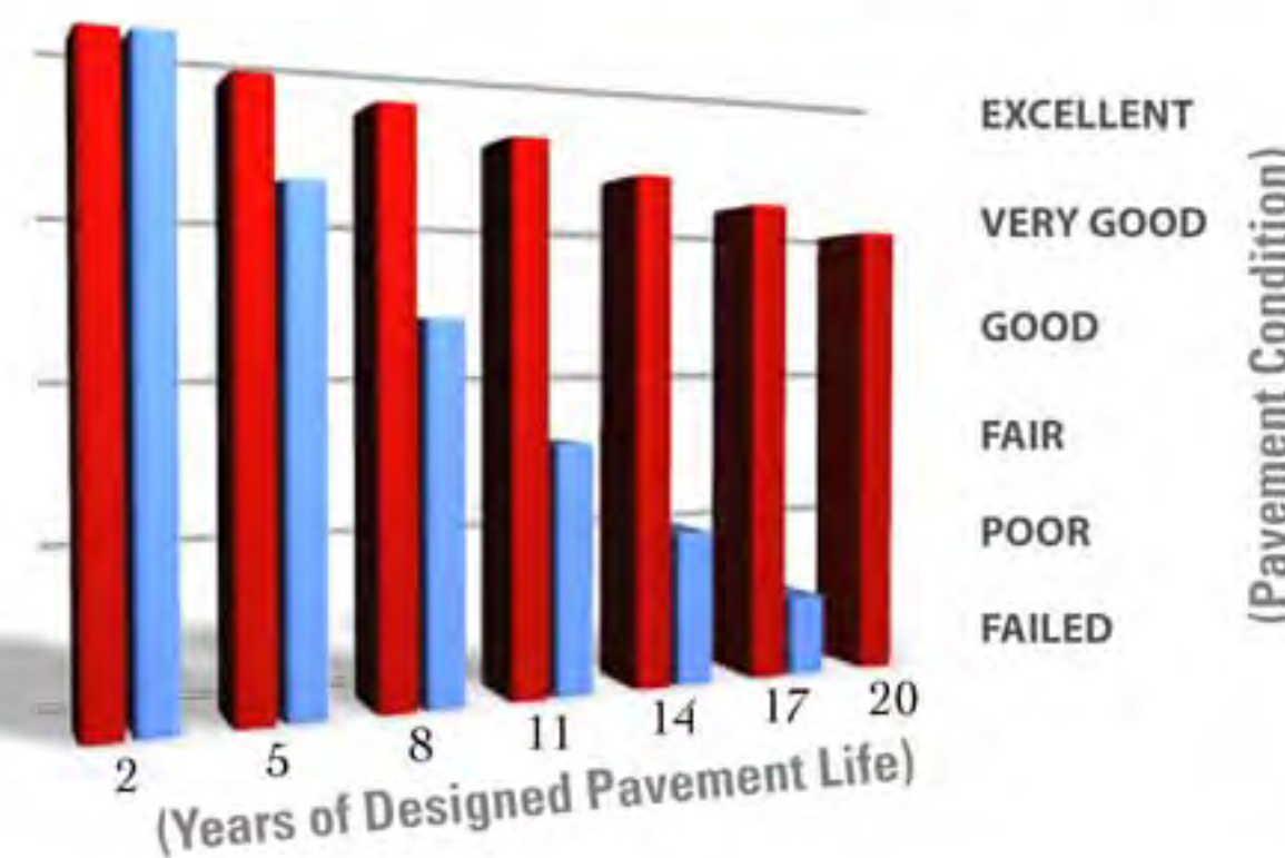
■ Scheduled Sealcoating ■ No Scheduled Sealcoating