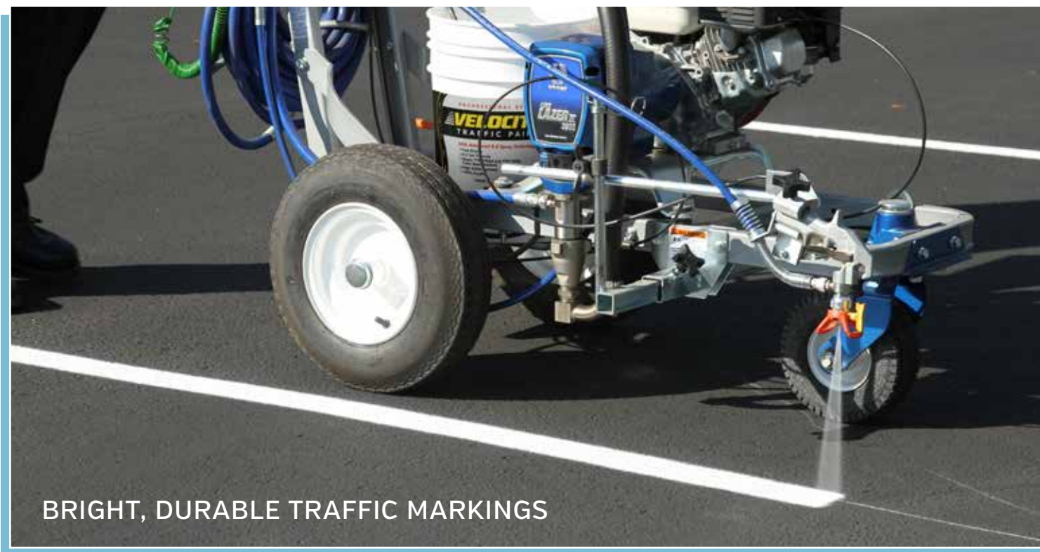
BRIGHT, DURABLE TRAFFIC MARKINGS