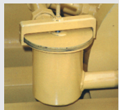
Easy Access Basket Strainer Reduces Tip Clogging