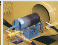
300,000 BTU Vapor Heat System with Safety Shut-Off