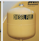
5 Gallon Diesel Wash Down System