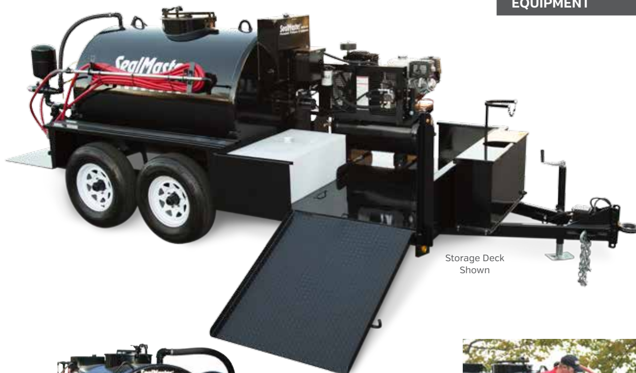
Storage Deck Shown