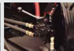
Direct-Drive FWD/REV Agitation