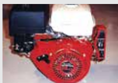
13 HP Honda Engine