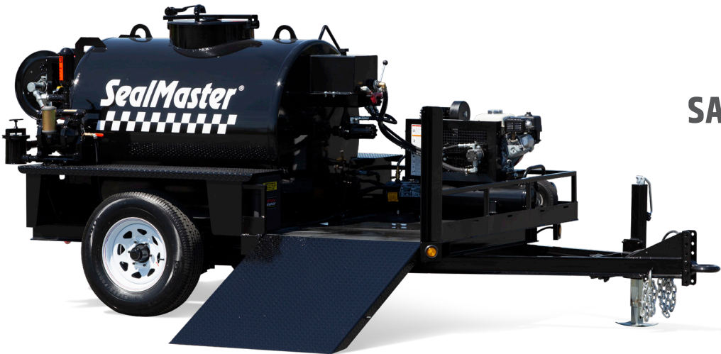
SANDPUP™ TR 300 300-GALLON UNIT