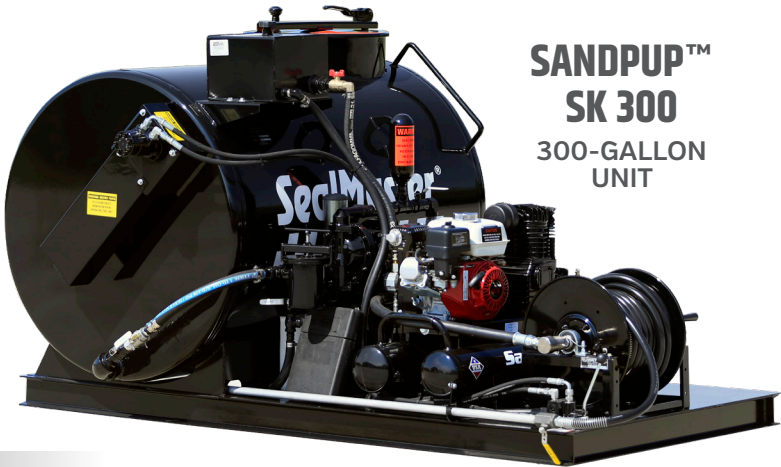
SANDPUP™ SK 300 300-GALLON UNIT

THE ECONOMICAL WAY TO TRANSPORT AND APPLY PAVEMENT SEALERS WITH SAND