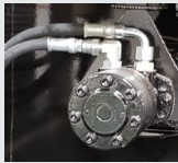
Hydraulically Driven Full Sweep Agitation