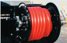
Hose Reel with 75-foot Hose