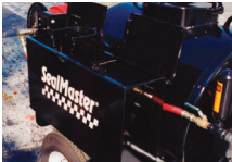
Brush / Squeegee Water Box

* Call for pricing | Components subject to change