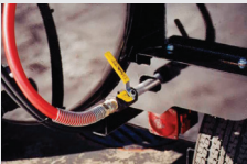
Hide-Away Spray Wand Holder (SandPup Trailer)