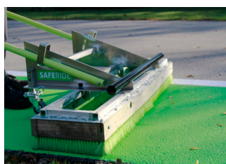
BRUSH BOX FRAME WITH BRUSHES