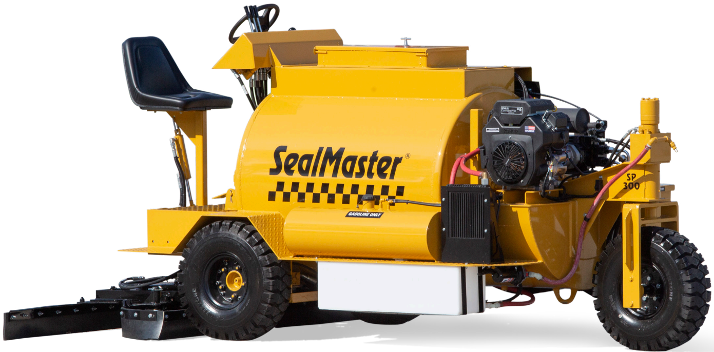
Shown with water option