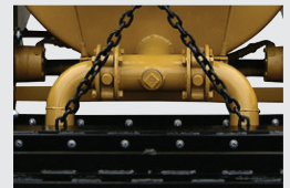
Dual Easy-Open Butterfly Sealer Discharge Valves