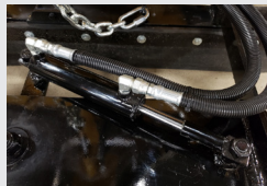
Hydraulic Shift for Angling the Squeegee