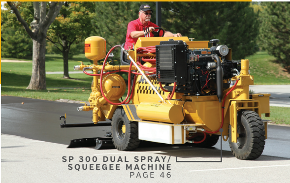
SP 300 DUAL SPRAY/ SQUEEGEE MACHINE PAGE 46