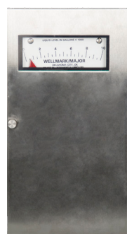
Liquid Level Scale