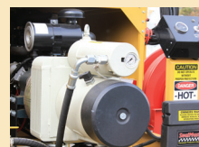
Direct Drive Air Compressor