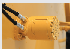
Direct-Drive FWD/REV Full Sweep Agitation