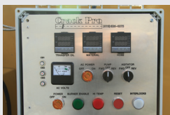
Digital Control Center with protective steel cover