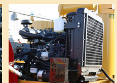
V1505 Kubota Diesel Engine