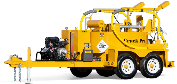
TR 260 Double Pump now available!