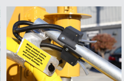
Horn button on wand