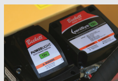
Diesel fired Beckett Burner