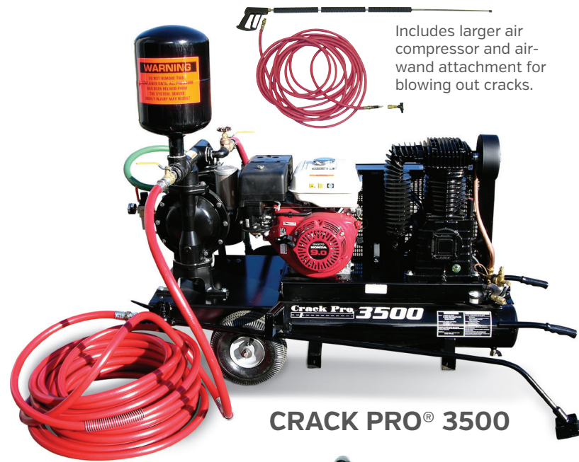
CRACK PRO® 3500