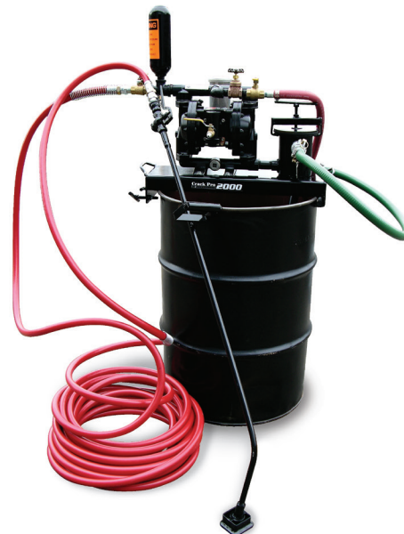
CRACK PRO® 2000