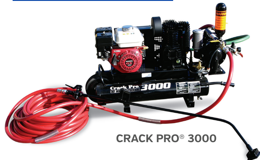
CRACK PRO® 3000