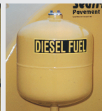
5 Gallon Diesel Wash Down System