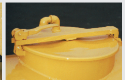
Lock down lid with breather vent