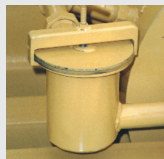
Easy Access Basket Strainer Reduces Tip Clogging