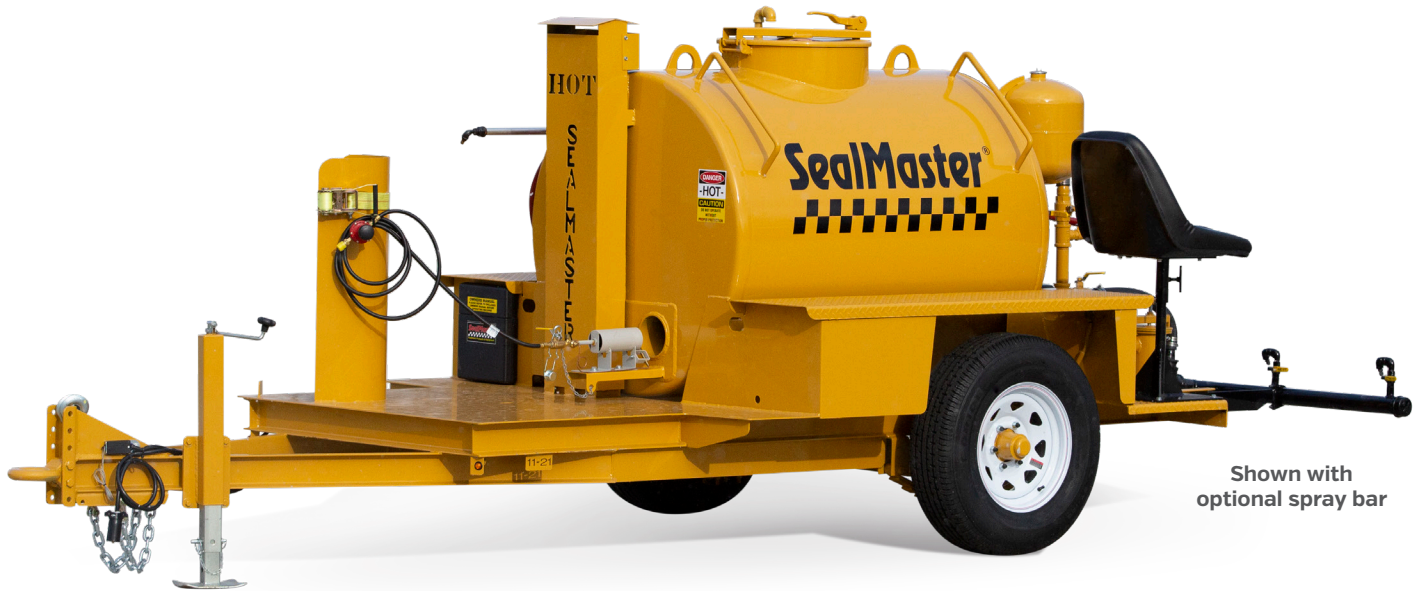
Shown with optional spray bar