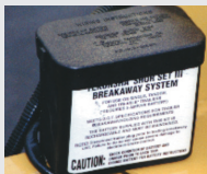
Electric Brakes with Safety Break-Away System