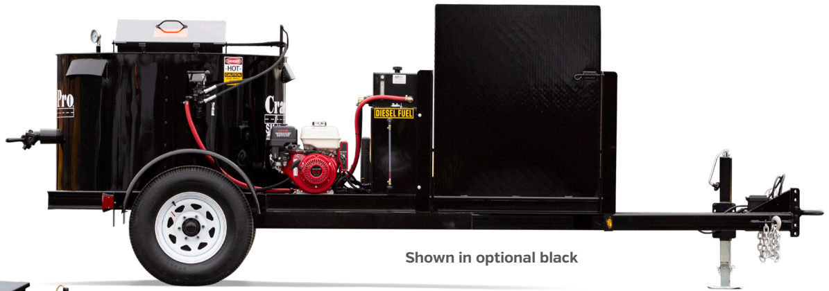
Shown in optional black