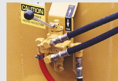
Forward / Reverse Full Sweep Agitation