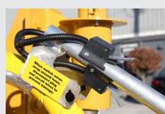
Horn button on wand