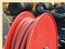
100' x 5/8" Reeled Hose & Wand