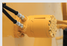
Direct-Drive FWD/REV Full Sweep Agitation