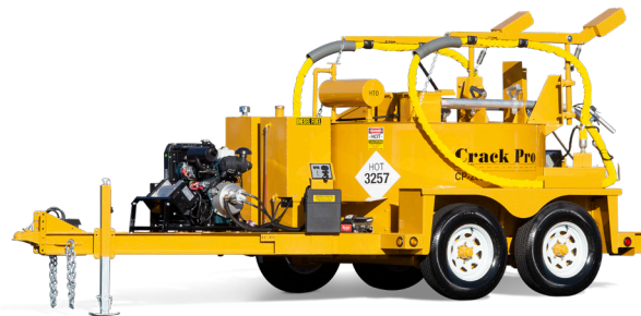
TR 260 Double Pump now available!