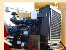
V1505 Kubota Diesel Engine