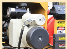
Direct Drive Air Compressor