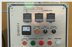
Digital Control Center with protective steel cover