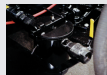
One Gallon Basket Strainer