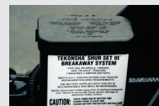
Safety Break-Away Braking System