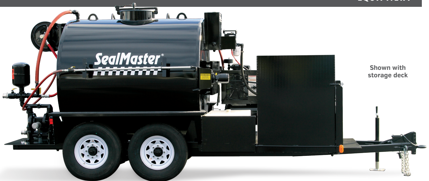
Shown with storage deck