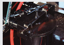
One Gallon Basket Strainer