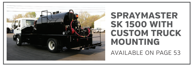
SPRAYMASTER SK 1500 WITH CUSTOM TRUCK MOUNTING AVAILABLE ON PAGE 53