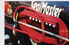
75-foot Hose and Spray Wand