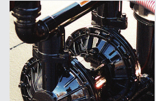
Dual Diaphragm Material Pump