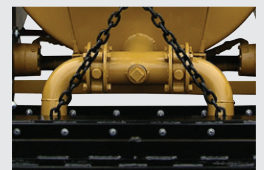
Dual Easy-Open Butterfly Sealer Discharge Valves