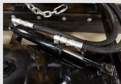
Hydraulic Shift for Angling the Squeegee