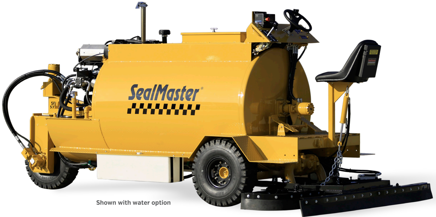
Shown with water option