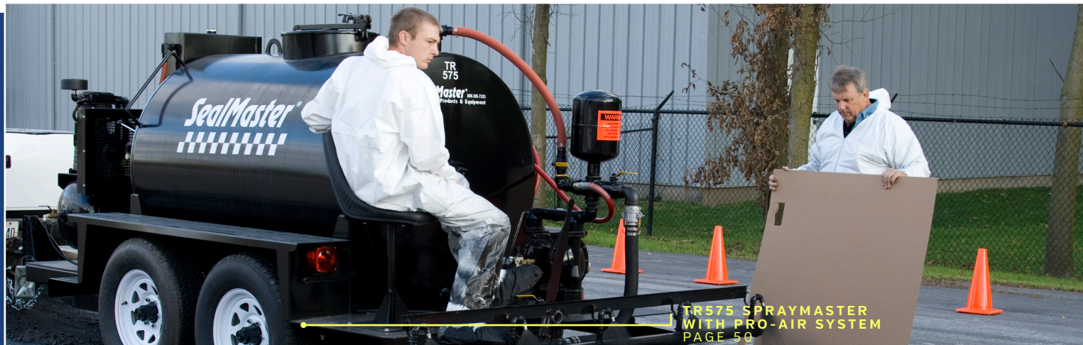
TR 575 SPRAYMASTER WITH PRO-AIR SYSTEM PAGE 50