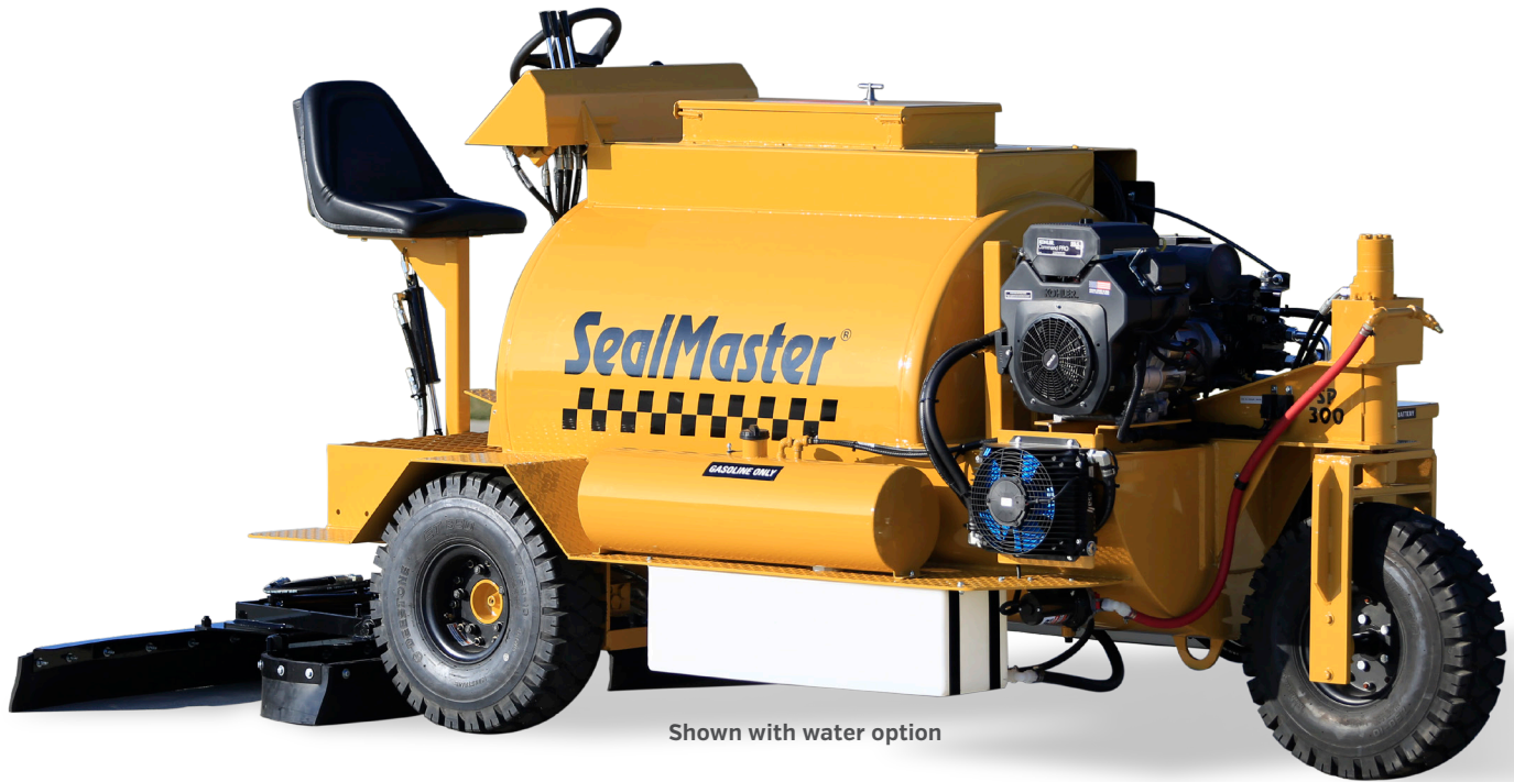
Shown with water option