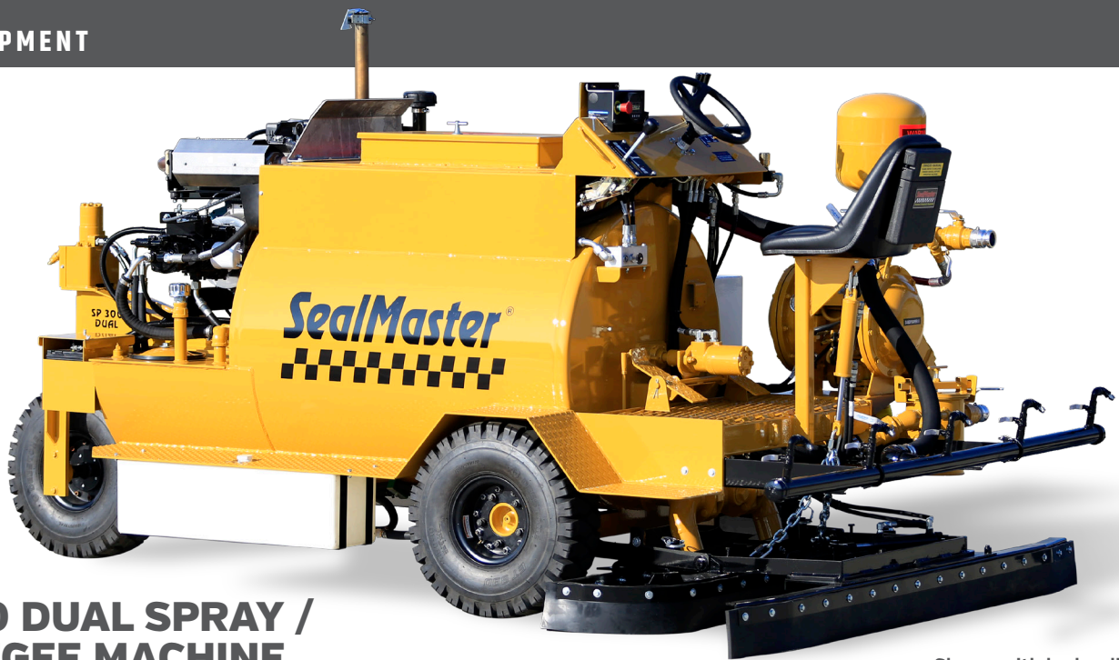
Shown with water option