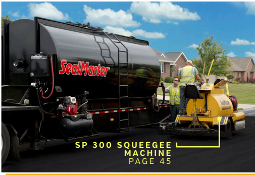
SP 300 SQUEEGEE MACHINE PAGE 45