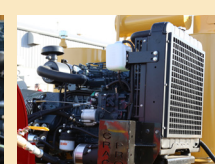
V1505 Kubota Diesel Engine