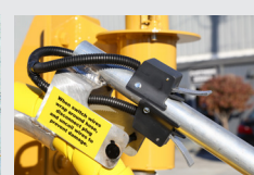
Horn button on wand