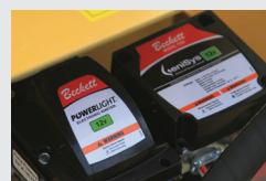
Diesel fired Beckett Burner