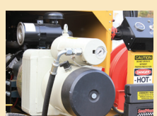
Direct Drive Air Compressor