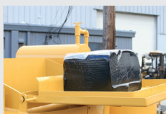
Anti-Splash Material Loading Hatch