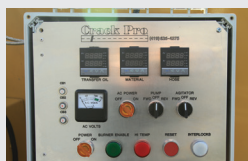
Digital Control Center with protective steel cover