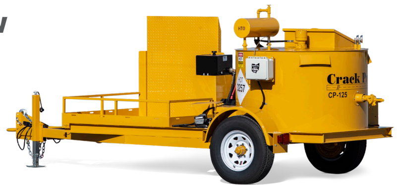
CRACK PRO 125 GRAVITY FLOW