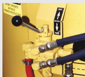
FWD/REV Hydraulic Agitation Valve