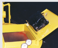
Anti-Splash Material Loading Hatch