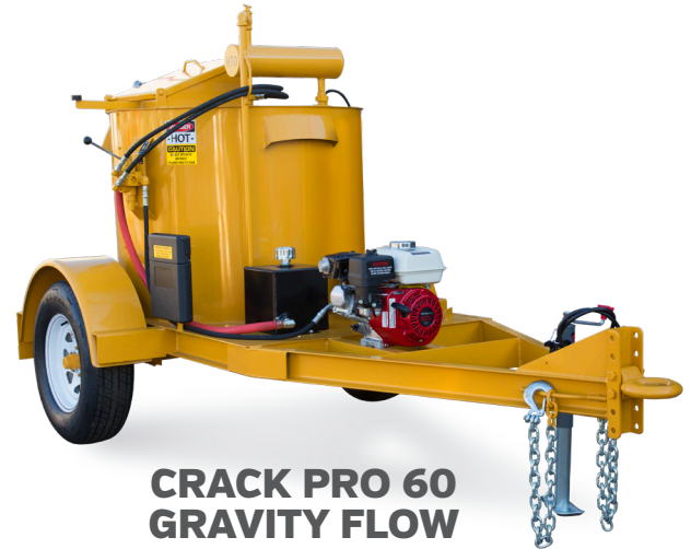
CRACK PRO 60 GRAVITY FLOW