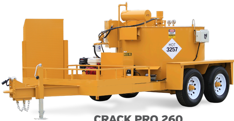
CRACK PRO 260 GRAVITY FLOW