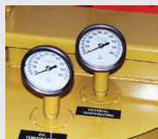
Oil and Material Temperature Gauges